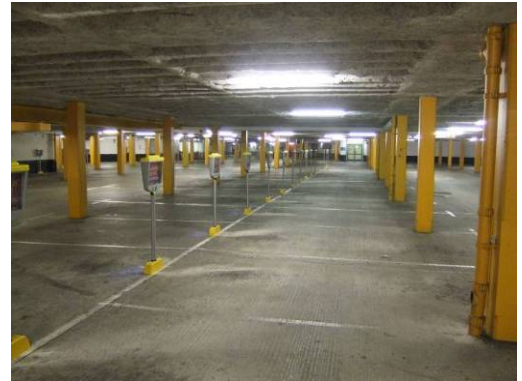
Enhancing site layout