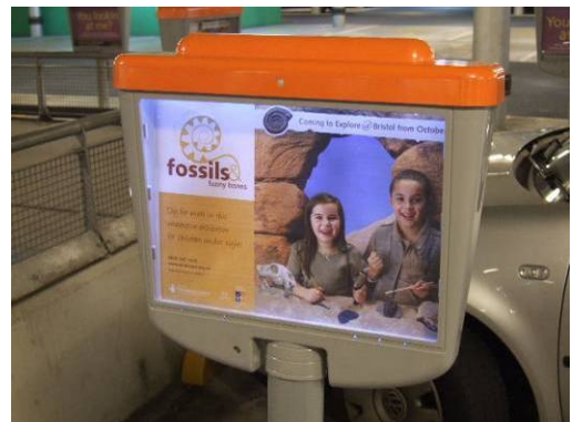
A3 Landscape format